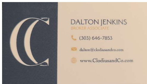
Clodius and Co. Real Estate