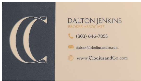
Clodius and Co. Real Estate